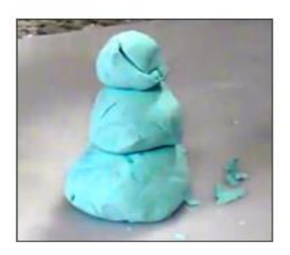
Shaving Cream + Cornstarch = Snow