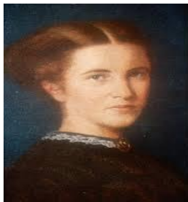
Elizabeth Garrett Anderson (Britain's first woman doctor)