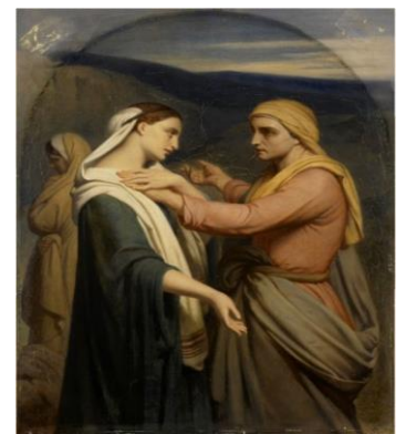
Ruth and Naomi