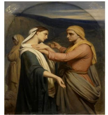
Ruth and Naomi