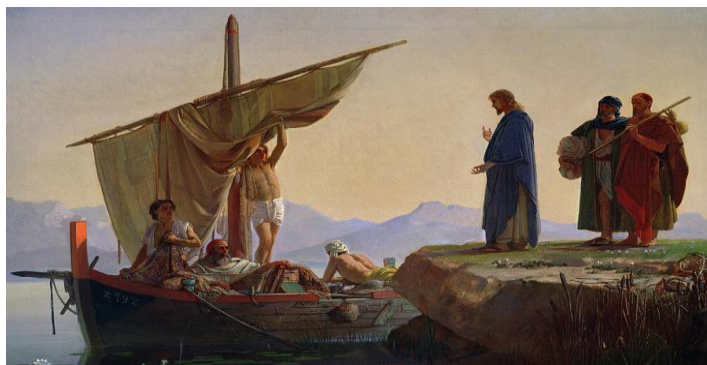
The Call of the Disciples