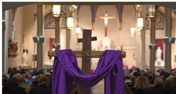
The Empty Tomb