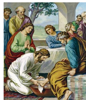
Jesus washes the feet