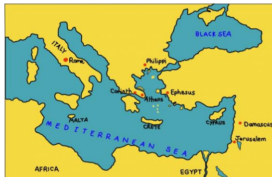
Map of St Paul's Journey