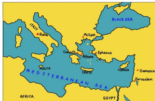
Map of St Paul's Journey