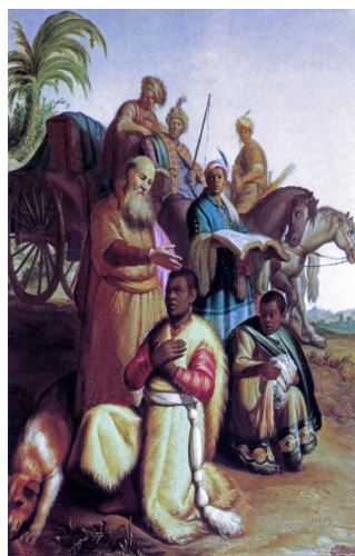
The Baptism of the Ethiopian Eunuch

*Acts 8: 26-30, 34-38 - GS 3 pg 138-139; Philip and the Ethiopian Official