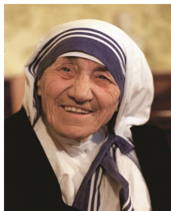
Saint Teresa of Calcutta