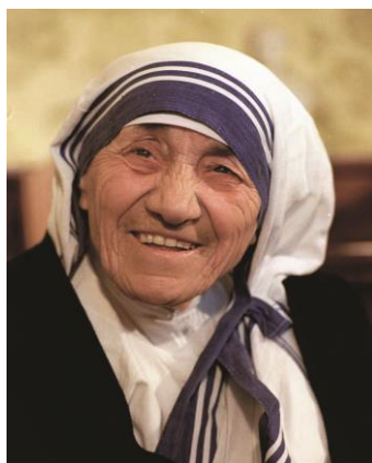
Saint Teresa of Calcutta