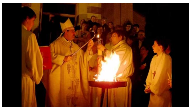
The Easter Vigil