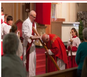
Veneration of the Cross