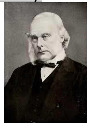
Joseph Lister (British Surgeon – antiseptic)