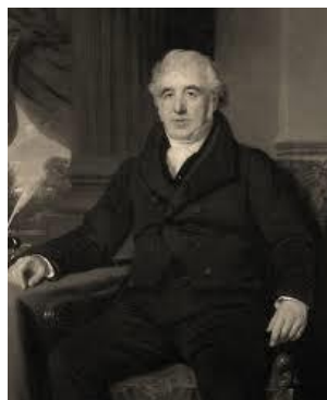
Charles Macintosh (Invented waterproof material)