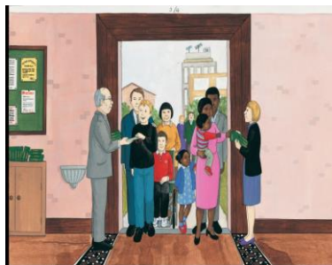
Gathering at Church on a Sunday

Luke 2: 41-52 – God's Story 2 page 63 Jesus teaches the people in the Temple