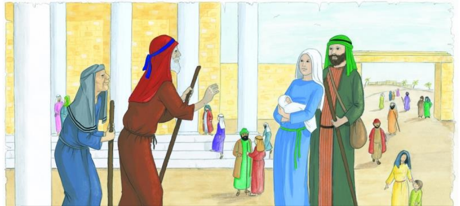
Anna and Simeon meet Jesus at the Temple