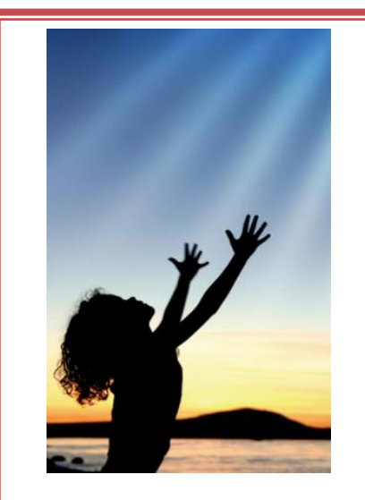
The Lord be with your spirit