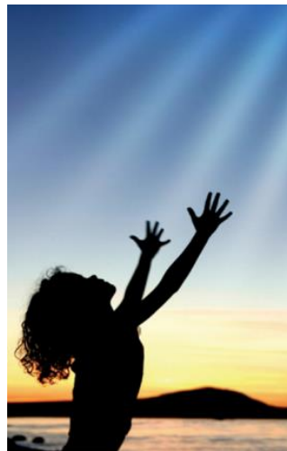
The Lord be with your spirit