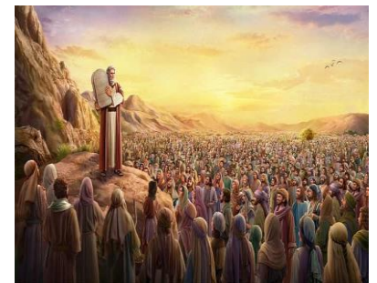
Moses is given Ten Commandments of Tablets of Stone