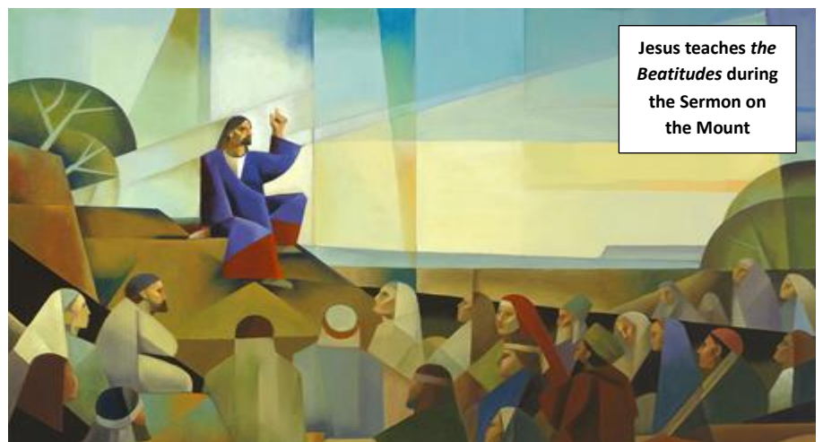
Jesus teaches the Beatitudes during the Sermon on the Mount

You will be blessed when you work for justice. When you respect and stand up for the rights of others, God will give you life to the full