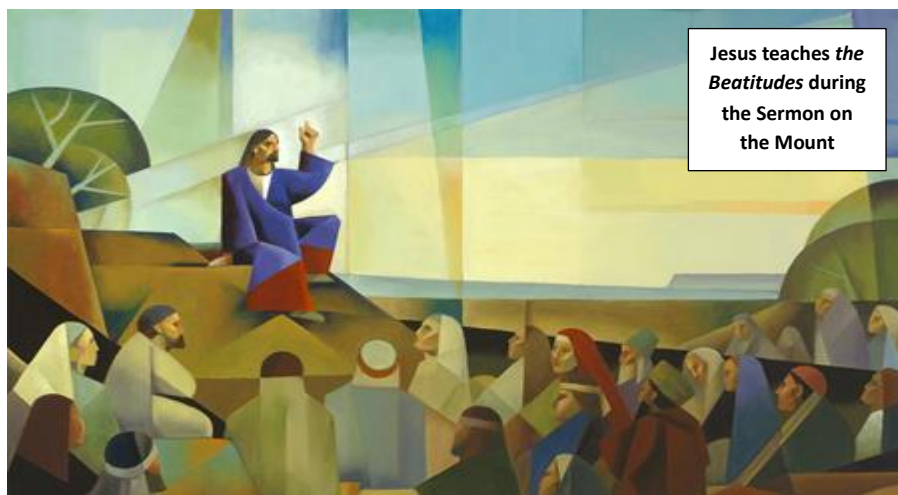
Jesus teaches the Beatitudes during the Sermon on the Mount

You will be blessed when you work for justice. When you respect and stand up for the rights of others, God will give you life to the full