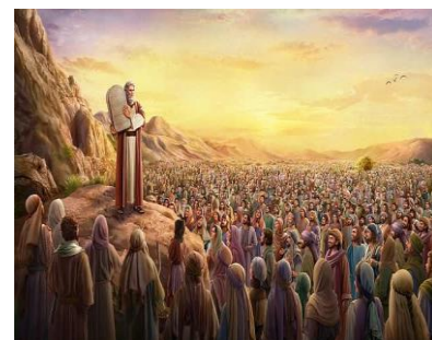
Moses is given Ten Commandments of Tablets of Stone