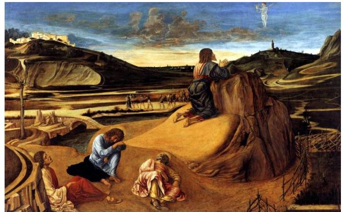
The Agony in the Garden by Giovanni Bellini

John 20: 1-10 The Empty Tomb (Easter Sunday)