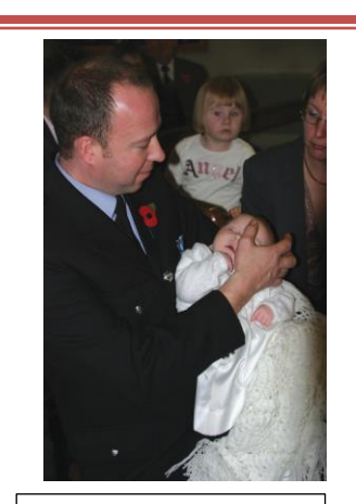
A sign of the cross is put on the baby's head