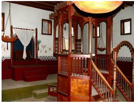
Inside a Synagogue