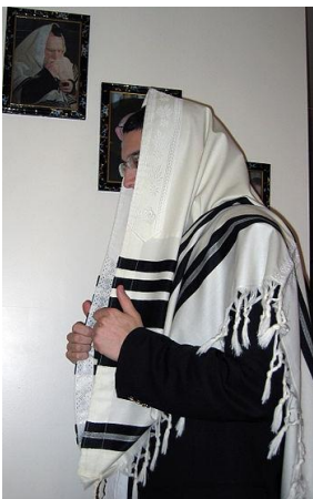
Tallit (Prayer Shawl)