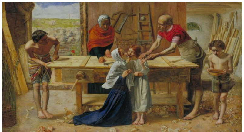
Christ in the House of His Parents by Millais