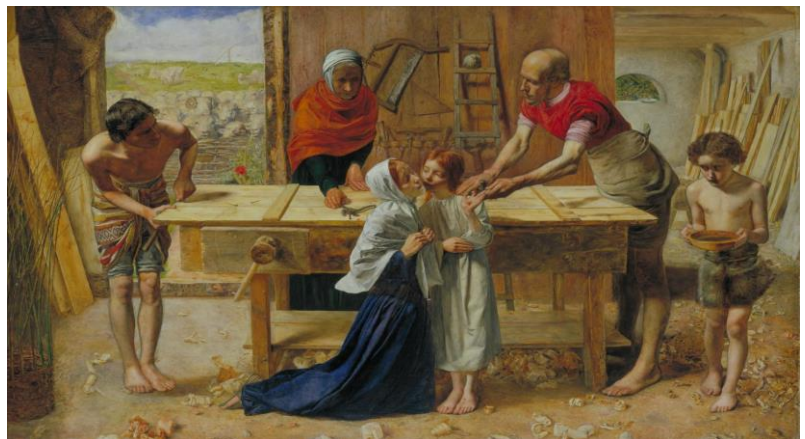
Christ in the House of His Parents by Millais