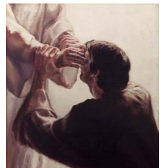
Jesus gives sight to a blind man