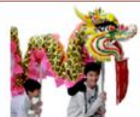
Human Body Puppet